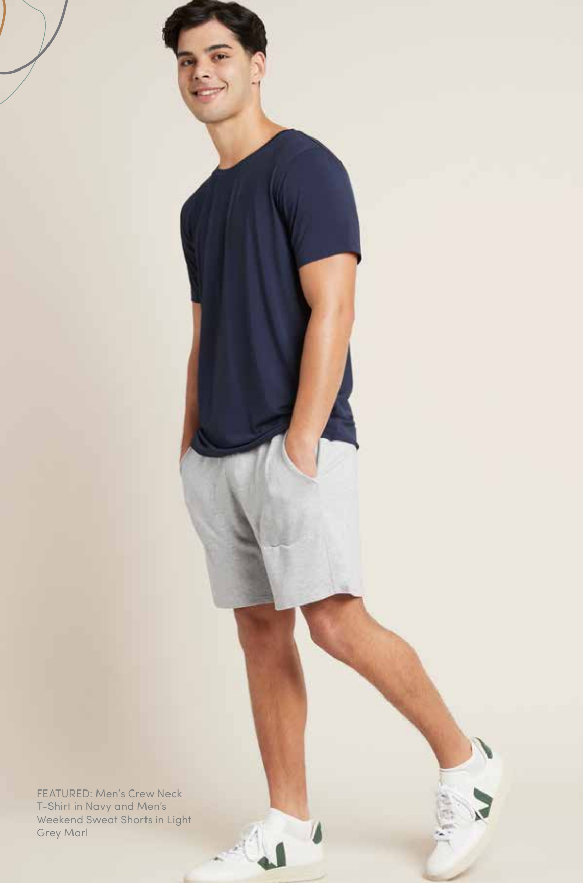
FEATURED: Men's Crew Neck T-Shirt in Navy and Men's Weekend Sweat Shorts in Light Grey Marl